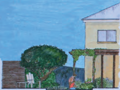
SECTION ELEVATION A-A